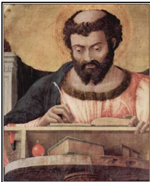
Detail of St. Lucas altarpiece - Andrea Mantegna