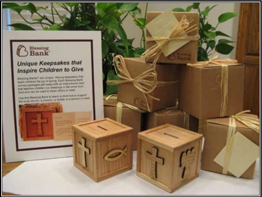
Blessing Banks available at St. Alban's Bookstore