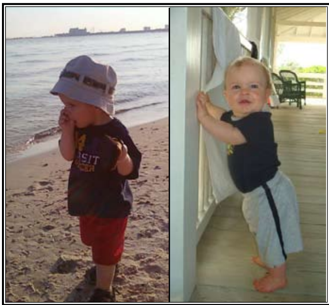
A couple of familiar parish babies enjoying their summer vacations.