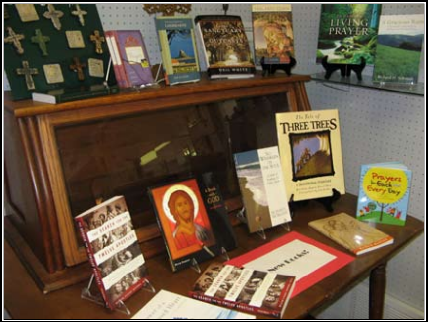
More new books available at St. Alban's Bookstore