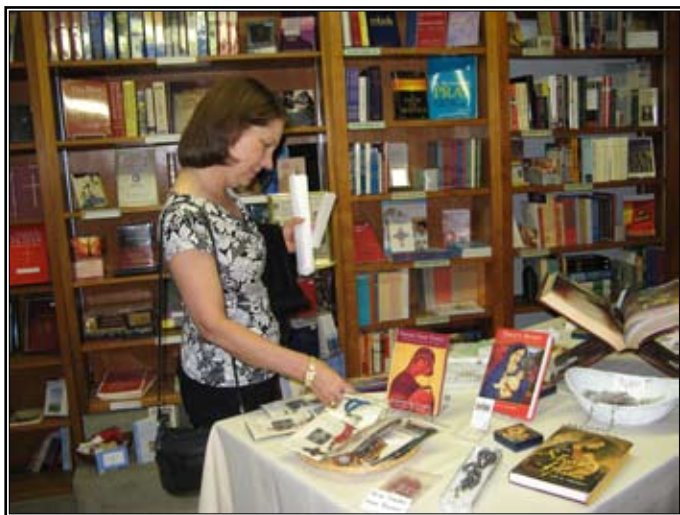
Customers have much to choose from at St. Alban’s Bookstore