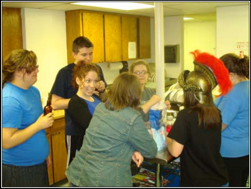
Teenage Youth Group gathering around to make Hot Cross Buns at the lock-in