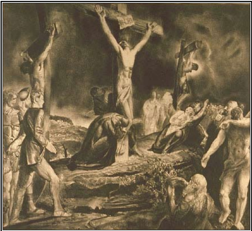
Crucifixion of Christ, 1923 by George Wesley Bellows (1883-1925)

When the sixth hour is at hand, everyone goes before the Cross, regardless of whether it is raining or whether it is hot. This place has no roof, for it is a sort of very large and beautiful courtyard lying between the Cross and the Anastasis. The people are so clustered together there that it is impossible for anything to be opened. A