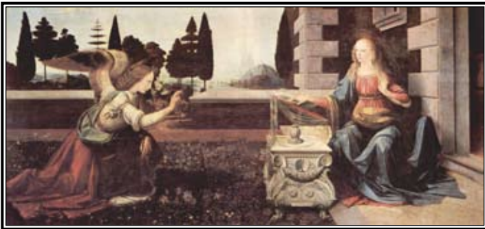
The Annunciation by Leonardo da Vinci (1472-1475)