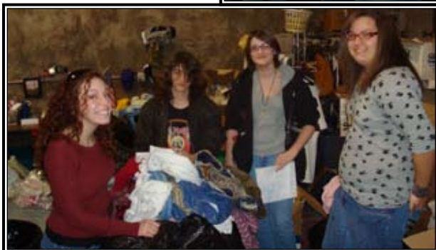
Youth Group sorting donations at the Union Gospel Mission