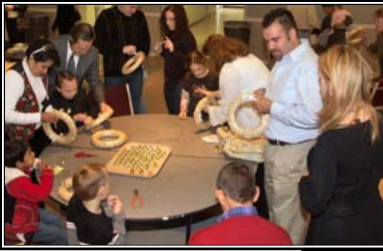
Making wreaths for our Family Advent Project.