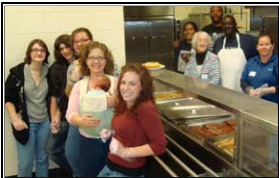
Youth Group serving lunch with other volunteers at the Mission